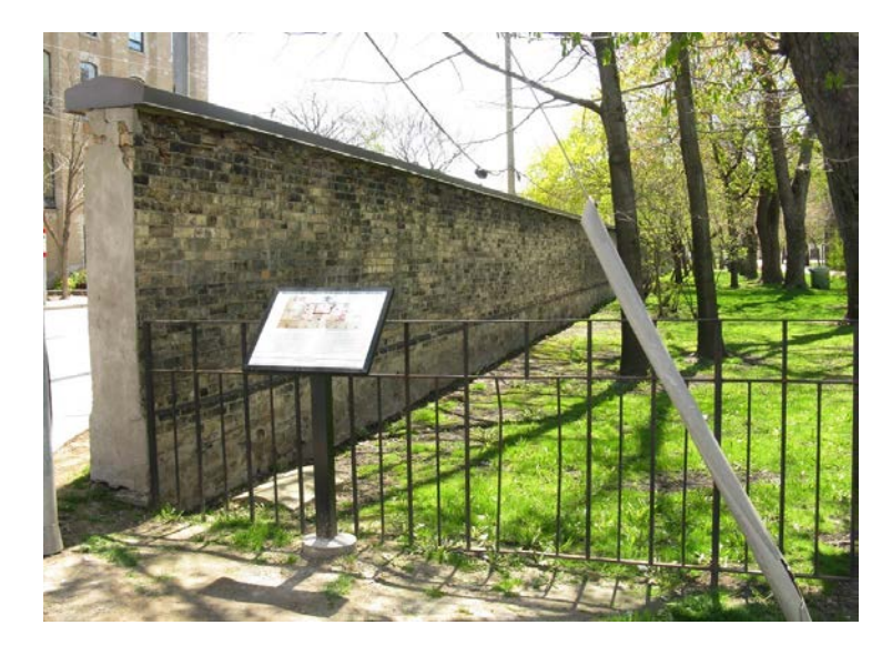
CAMH historic East Wall at Queen and Shaw Sts.

In the previous issue (Autumn 2015) we reported that restoration of the south and east stretches of the 19<sup>th</sup>-century Asylum walls will continue in the next phase of the site's overall redevelopment – along with the 1889 Historic East Workshop Building – subject to municipal approval. One contentious aspect of the Conservation Plan put forward by ERA Architects Inc. was a proposed removal of the northern-most Bay 43 of the East Wall at Queen St.