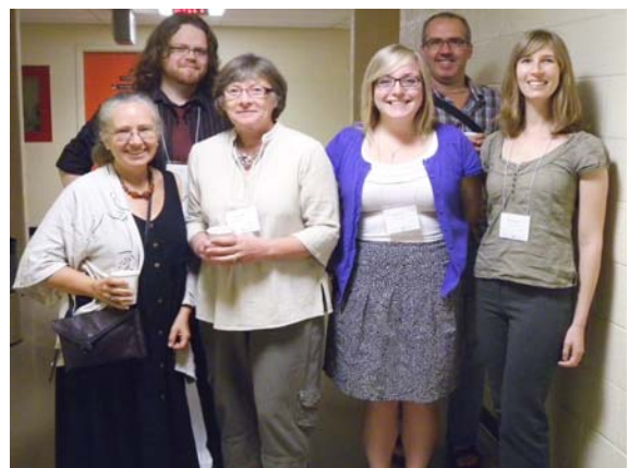
The author (left, rear) and friends at the annual conference of the Canadian Society for the History of Medicine, in Waterloo, May 2012.

Invariably, discussion and debate ruled the day. Should women more than men have authority over such issues? Was talking about reproduction an inescapable responsibility of an informed, modern citizen? How would older concepts of morality and propriety interact with these new understandings of the body, or the increasingly popular field of eugenics?