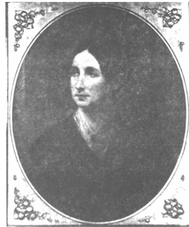
Dorothea Lynde Dix (1802–1887) , photoengraving from a portrait presented by Dix to the Dartmouth Asylum. Metal & wood engraving block, CAMH Archives.

Two days later Brown expressed the hope that the Asylum's board "will aim at something much higher than a ready transfer of the old machinery to the new building, and its mere adaptation for smooth working; they should make a great institution ." Moreover, one "where every good part of human nature is brought into play. We hope that the Institution, for which so much has been done, will be pointed to as a sample of what Canadians can do." (2 Feb. 1850, p.3)